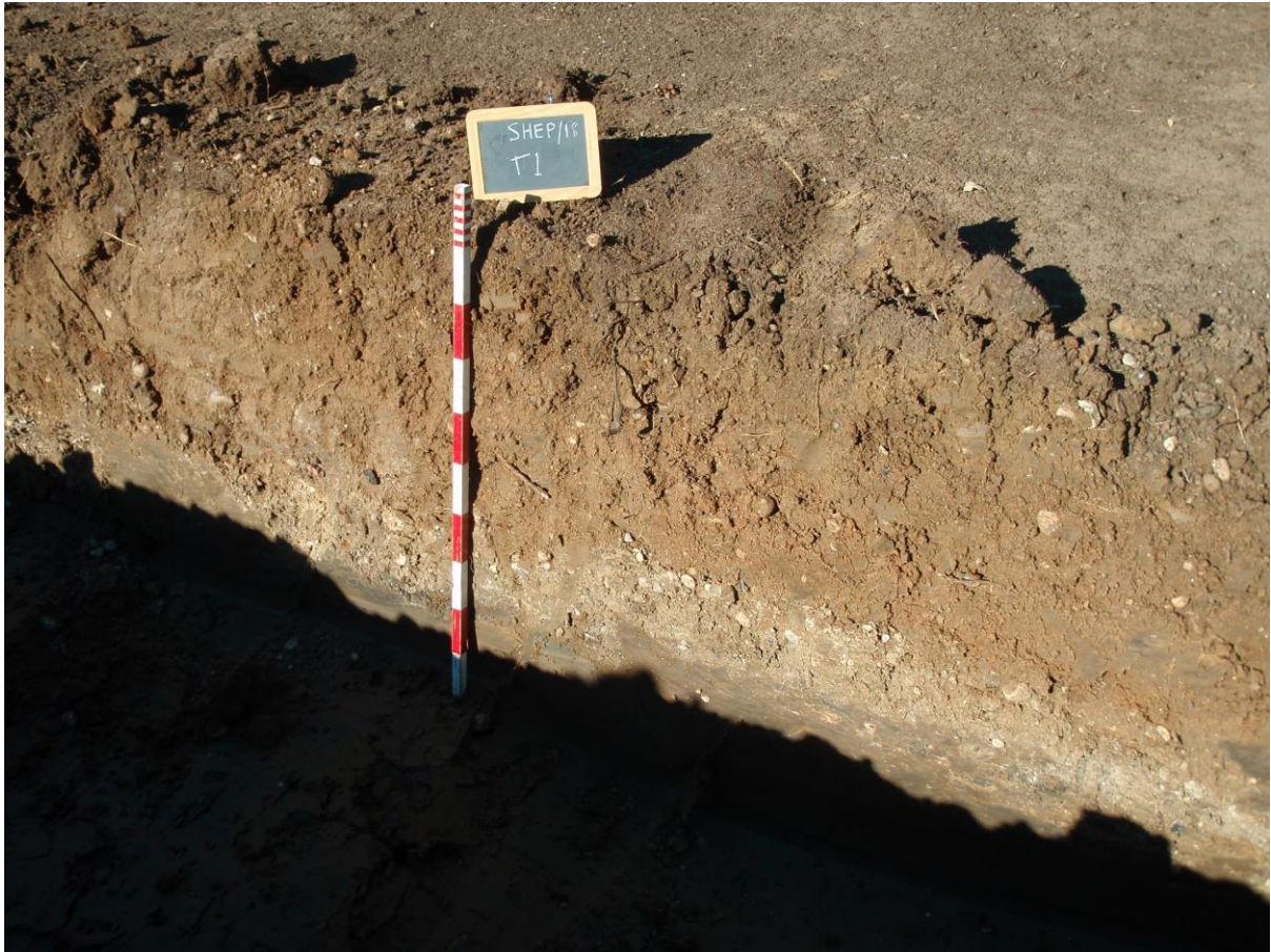
Plate 4. Section of Trench 1 (Scale shown 1.00m)