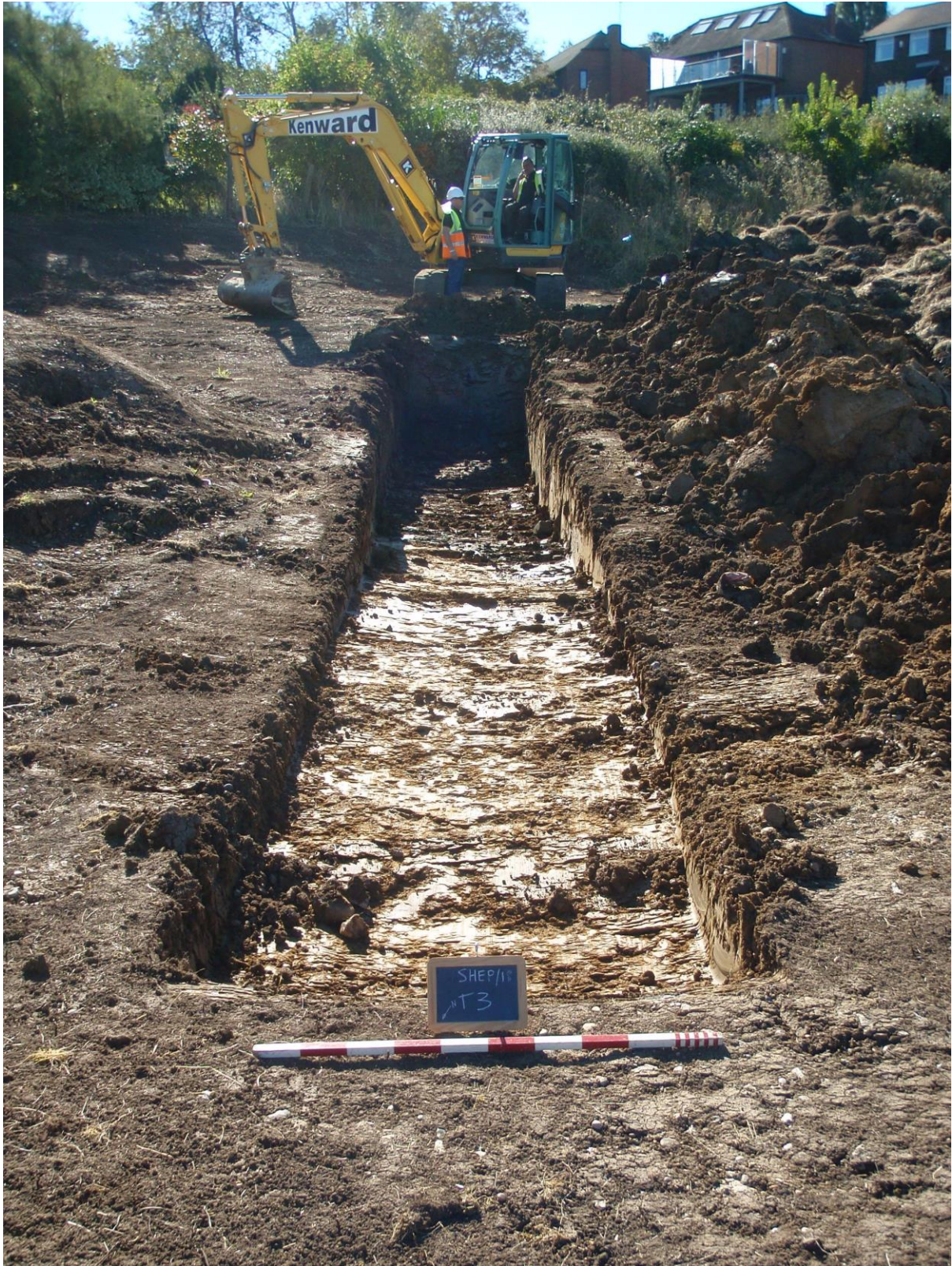
Plate 3. Trench 3 looking SSW (Scale shown 1.00m)