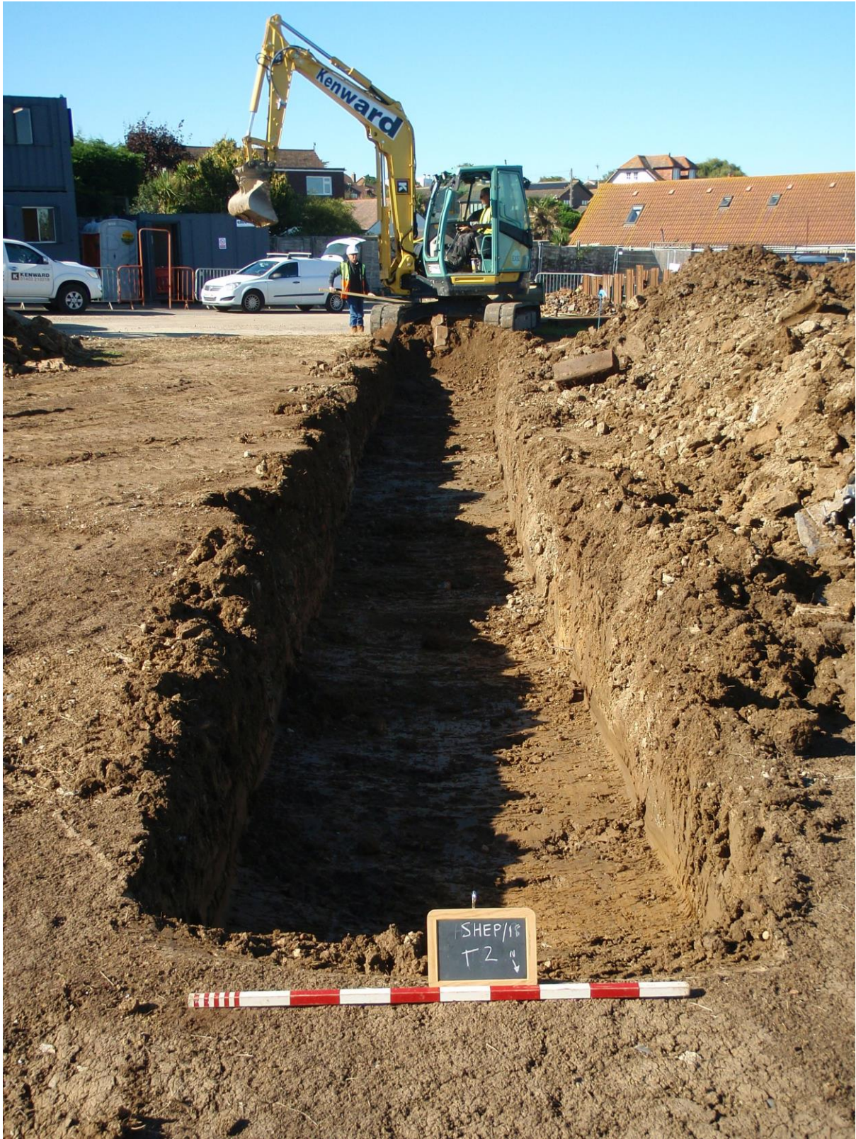
Plate 2. Trench 2 looking west (Scale shown 1.00m).