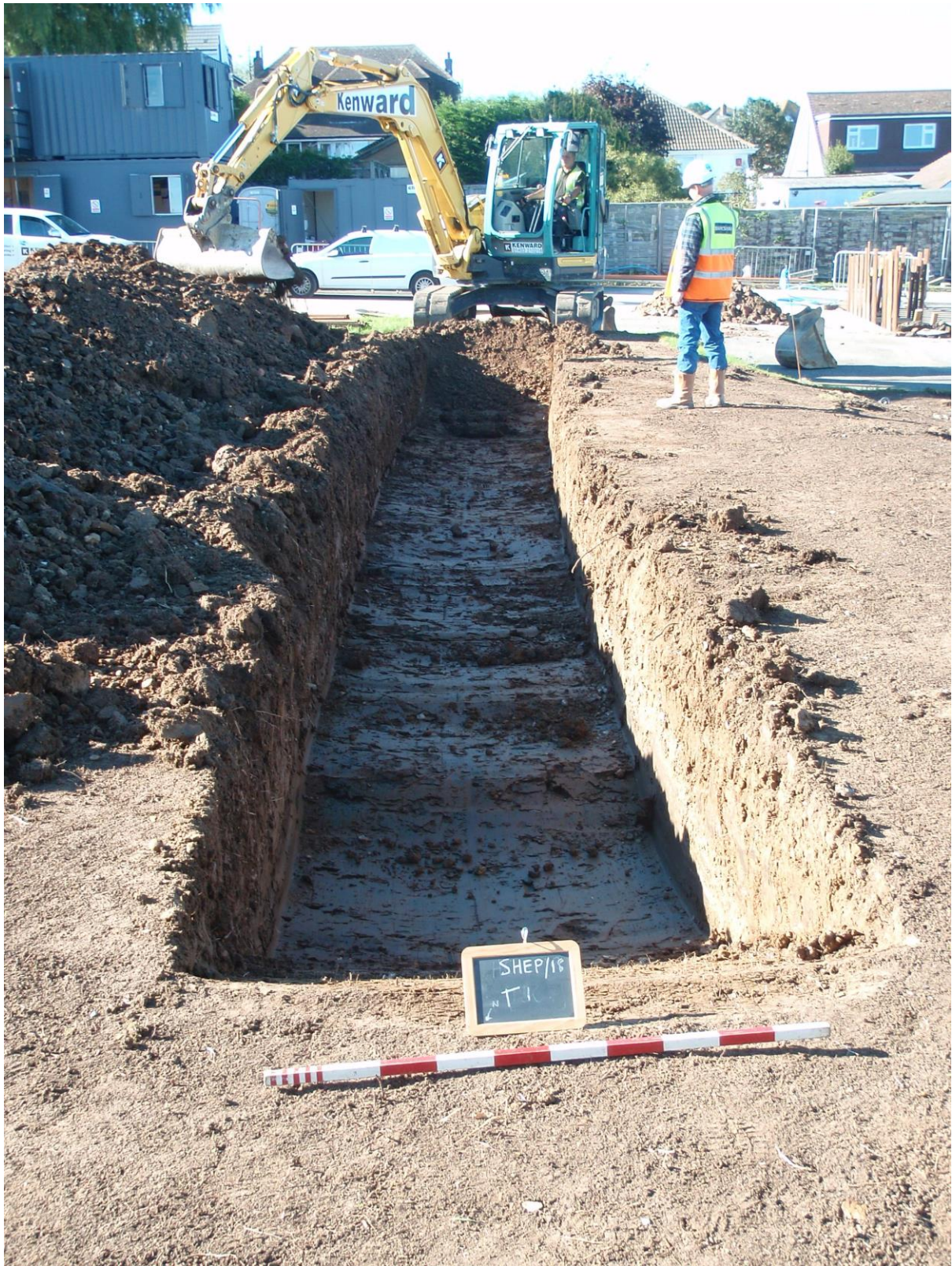
Plate 1. Trench 1 looking SSW (Scale shown 1.00m)